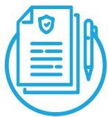
Cities, communes, countries, voivodeships