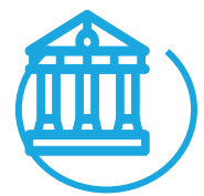
Monuments in Poland and abroad