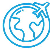
Tourist states and regions