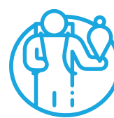
Meetings with travelers