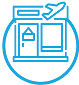
Travel agents from Poland and abroad