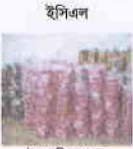
ইনিএল বৈদ্যুতিক তার