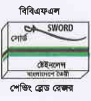
বিবিএফএল সোর্ট স্ট্রিংক্রোড রোলার