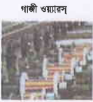
গালী ওয়্যাকস অনার তার (এসইসি, এলি, এইচ ভিভিসি)