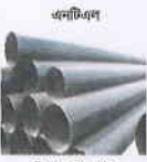
এনটিএল এসিআই, বিআই, এমএস পাইপ