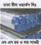
ঢাকা স্টিল ওয়ার্কস লিমিটেড এস এস রড ও বার সামগ্রী